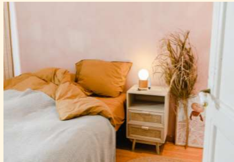
Learning @ IAEGlocal