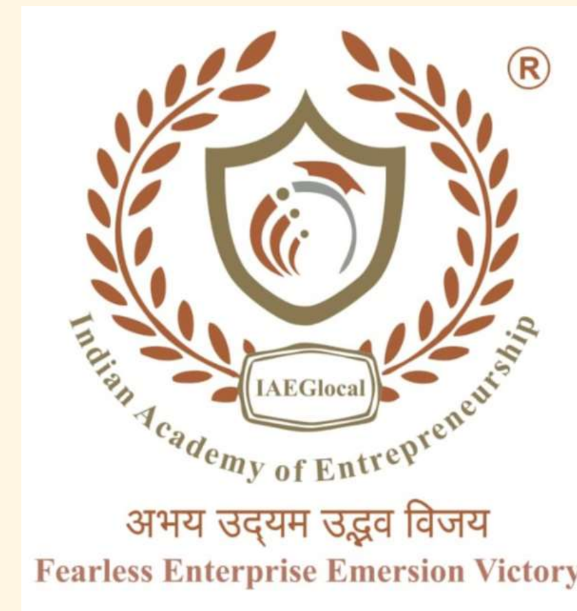
Global Head Quarter [GHQ] - India [Mumbai]