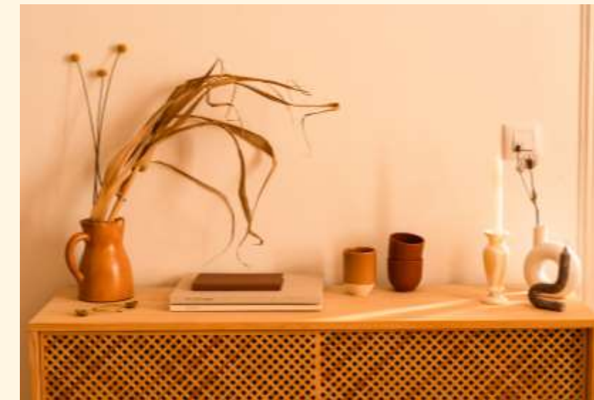
Ready Future Employable