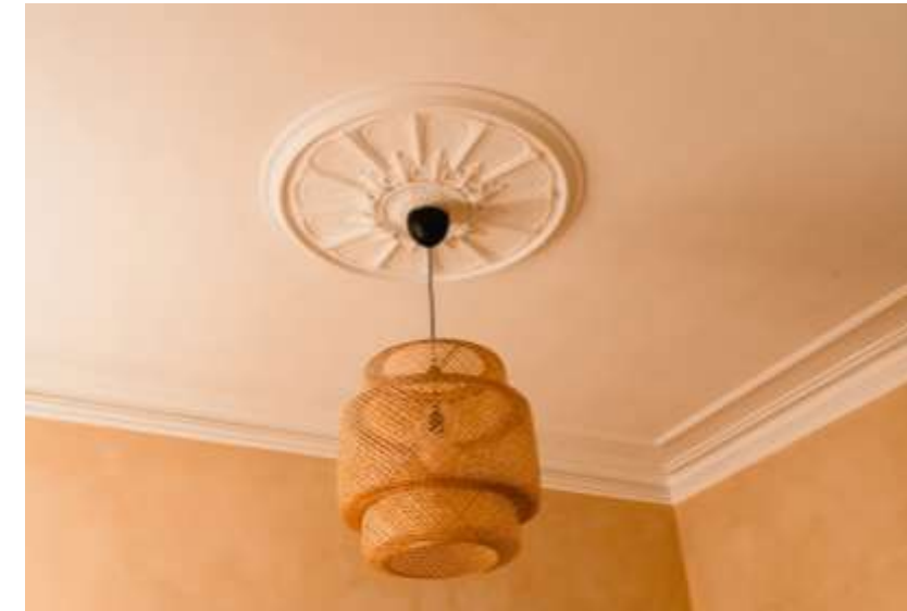
Ready Future Entrepreneur

Functional Support Startups [FSSUP] - Startup Labs; Branding & Marketing; Funding & Fiduciary; IT & ITES [DiaeT]; SCM & Logistics with People Resource Management [PRM] Extend Opportunities to all Individual Members/Solopreneurs To EARN while you LEARN with us to STAND on your own LEG to be a Future Ready Global Human Resources.