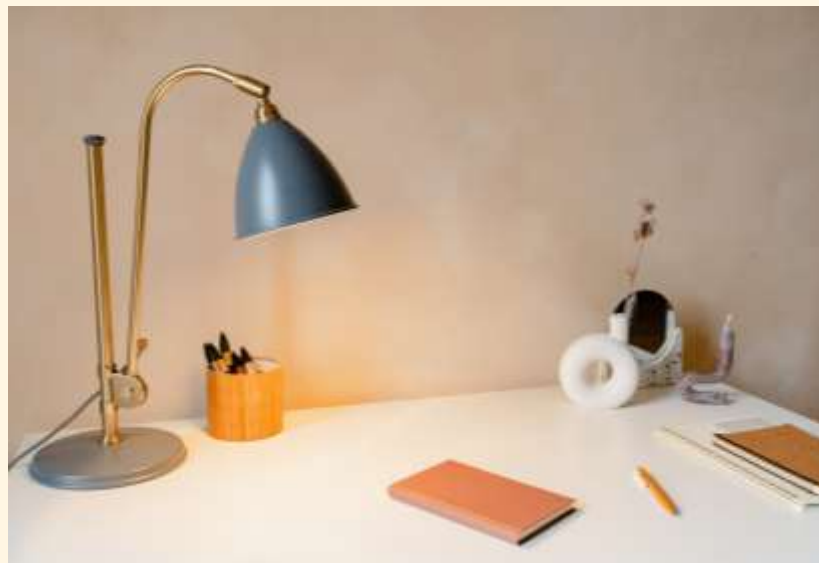
FSSUP @ IAEGlocal